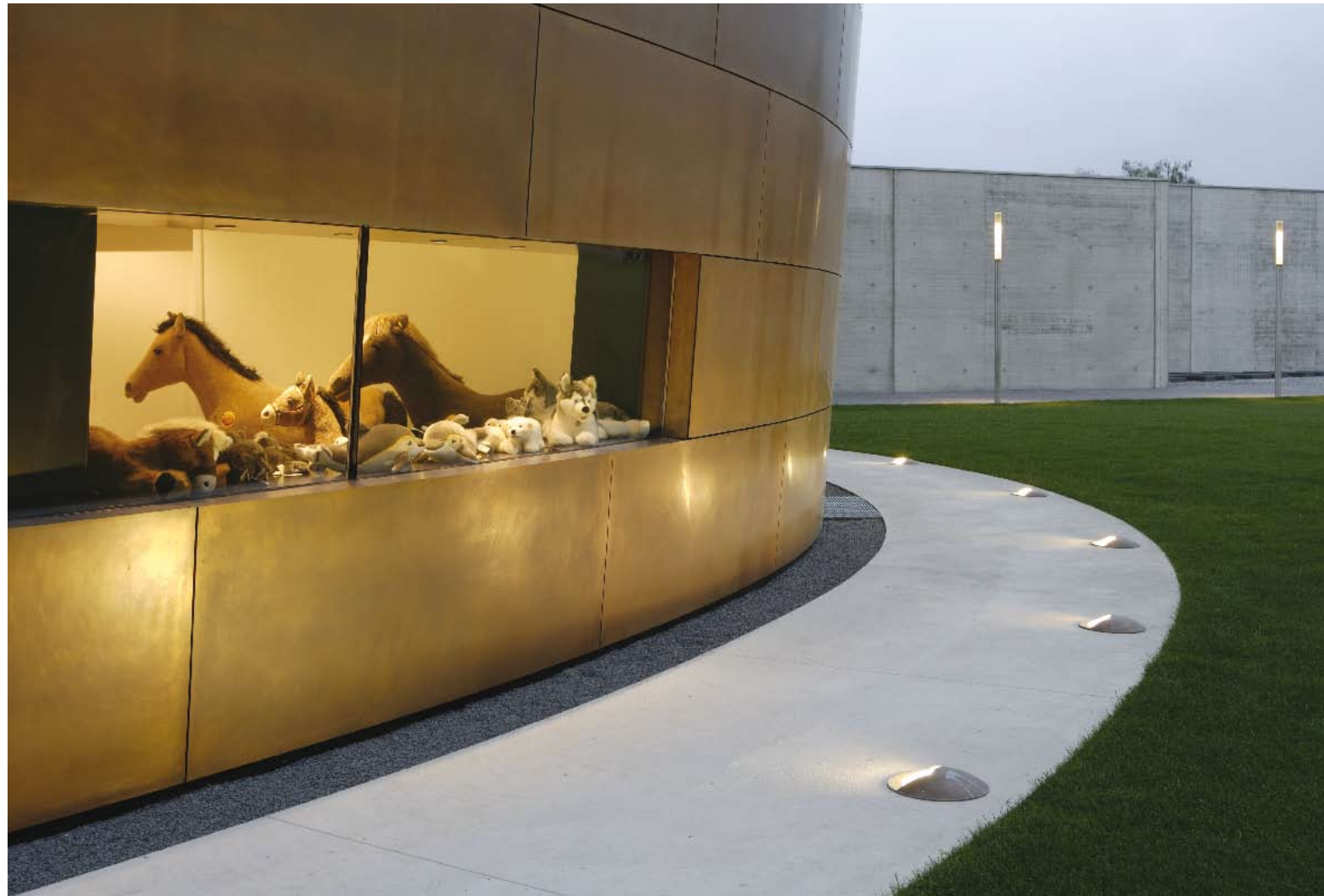
↑ | Shop window (slot) → | View from kids restaurant

Project name: Margarete Steiff Museum. Client: Margarete Steiff GmbH. Location: Permanent Exhibition, Giengen/Brenz, Germany. Exhibition Design and Realisation: Milla und Partner GmbH, Agentur & Ateliers, Stuttgart. Size: 2,300 m 2 . Completion year: 2005.